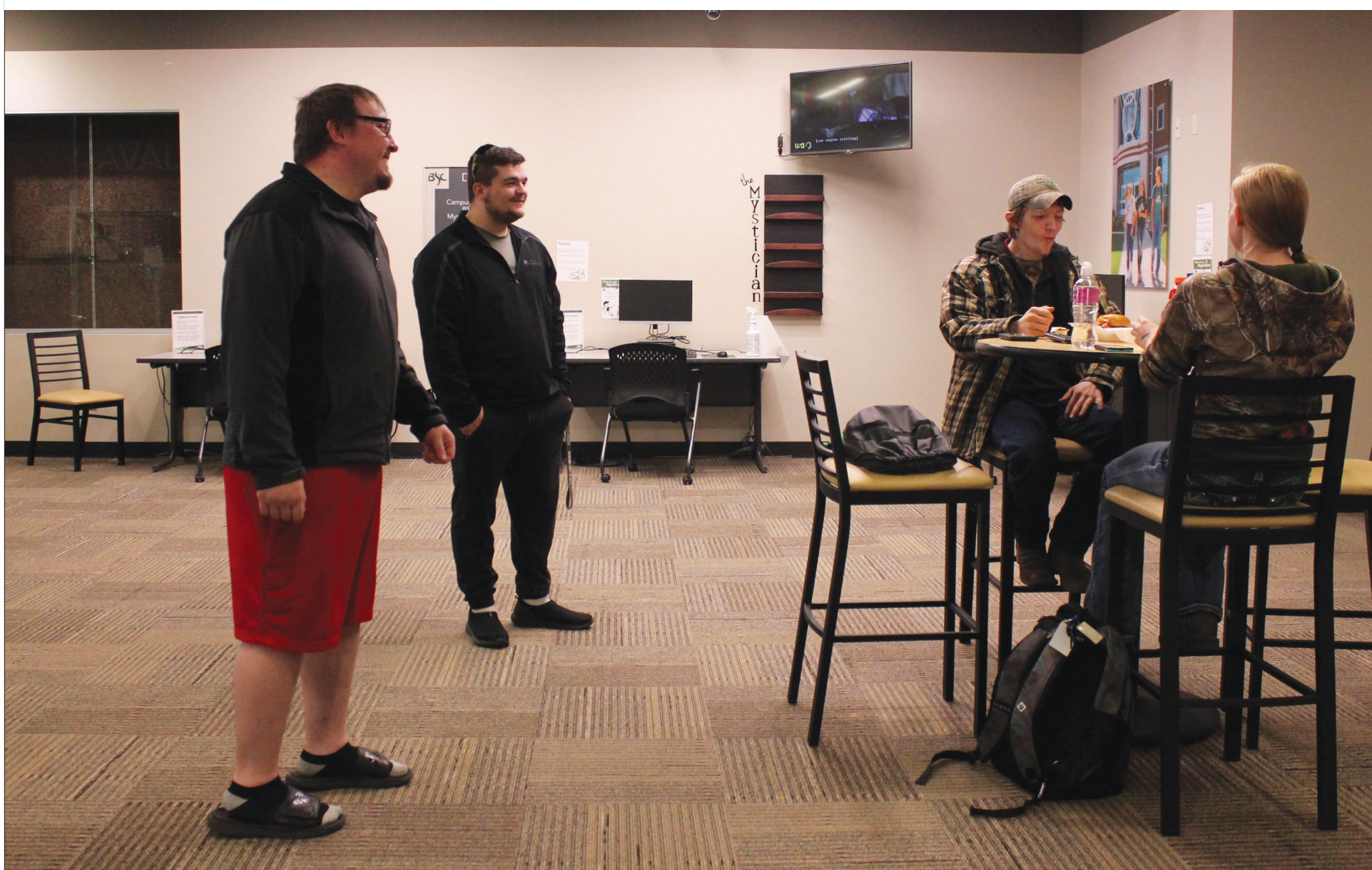
Resident BSC students having a chat while practicing social distancing in a largely empty Student Union. They were the only four students in a building that is normally occupied by many either grabbing refreshments or fulfilling classwork. Behind the students are computers provided by the school for resident students who do not have access to a personal device as classes switch to a virtual campus.