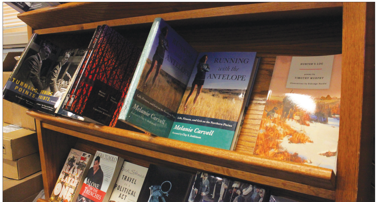
Bookshelf on the top floor of the Bismarck State College Bookstore contains a number of books published by the Dakota Institute. They are available for purchase on campus and online through Amazon .com.

In addition to hardcover and paperback books, the collection also includes DVDs. For more information about The Dakota Institute Collection at BSC and a listing of available titles, visit the BSC website https://bismarckstate.edu/community/DakotaInstituteCollection/