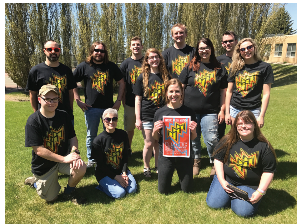
Mystician Staff and Advisers 2016-2017