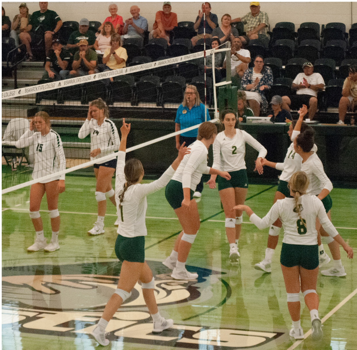
The BSC Volleyball team celebrate after winning a point during their match with Dickinson State JV on Aug. 29.