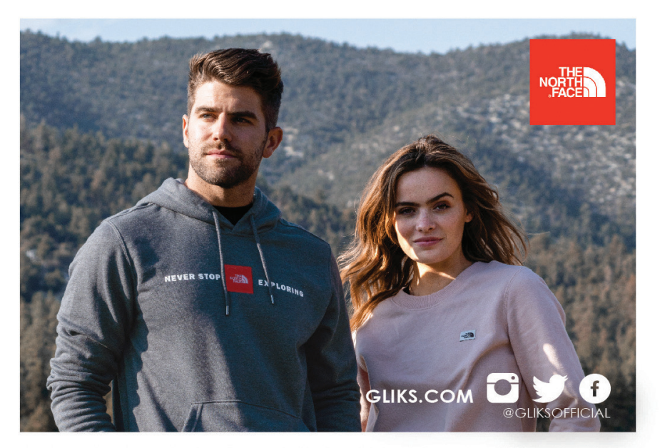
NEVER STOP EXPLORING IN THE NORTH FACE