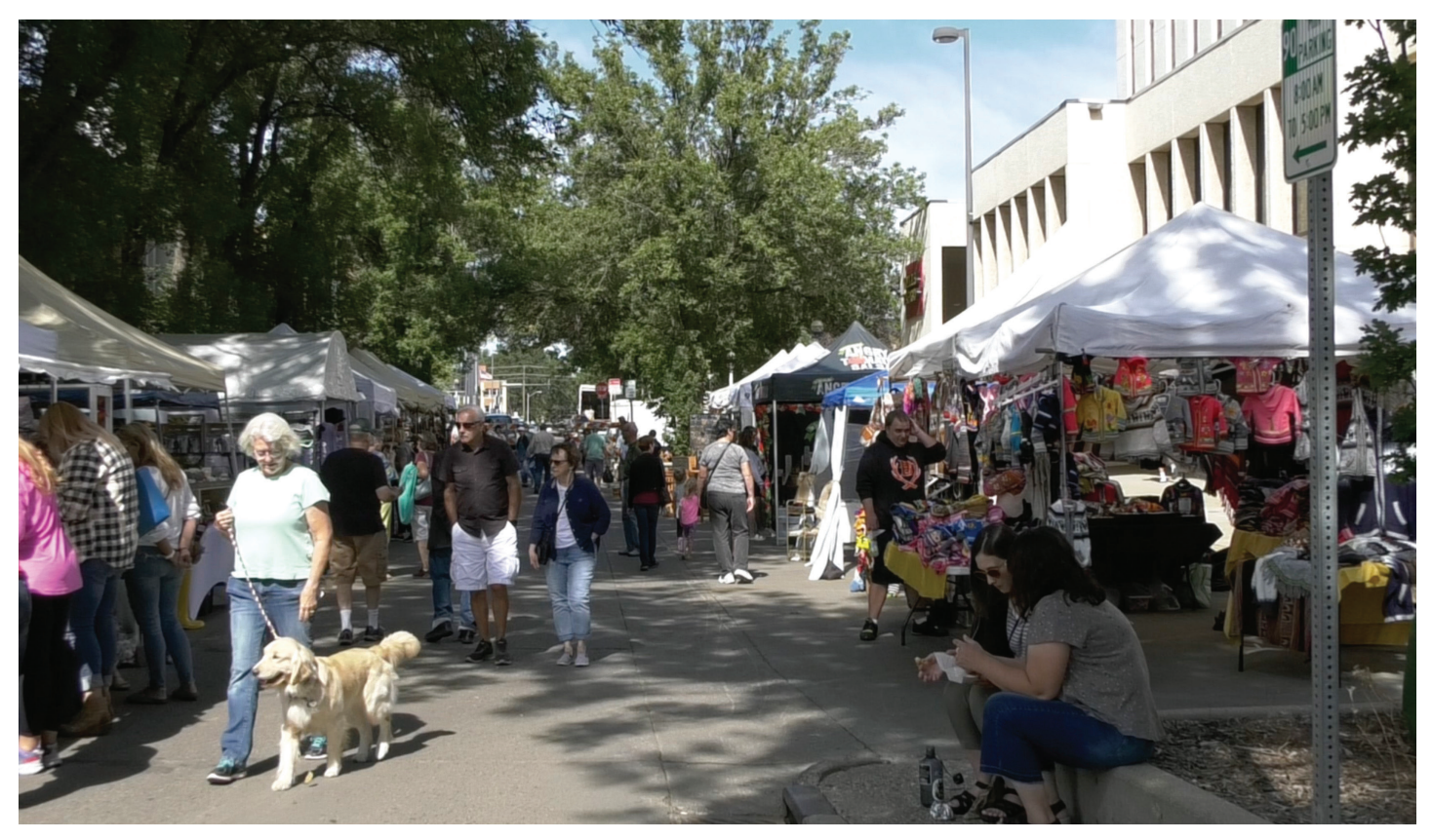
People of all ages visited the booths during the yearly event.

"It's really a great community event that has something for everybody."