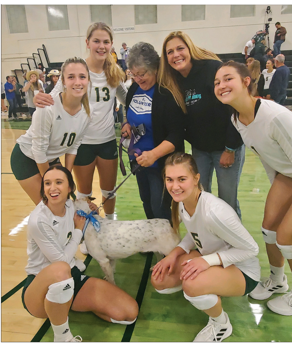
Mystic Volleyball players pose with members of Furry Friends Rockin' Rescue.