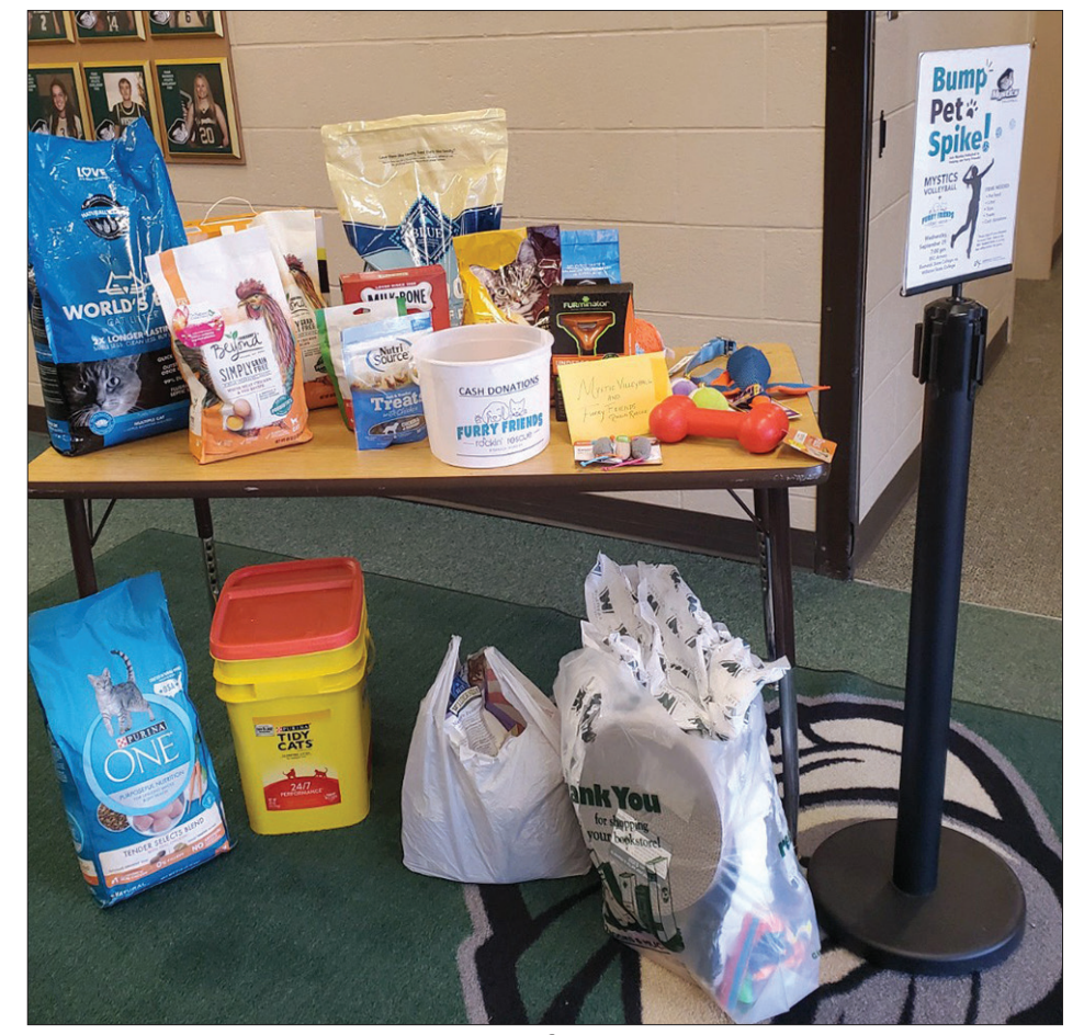
Many items were donated to benefit rescue animals on Bump, Pet, Spike night.