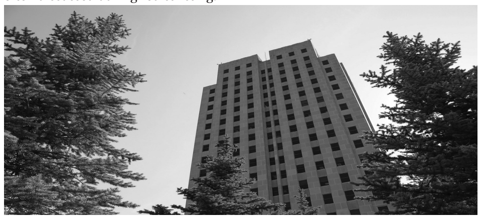
All legislative sessions are held at the State Capitol Building in Bismarck.

Bismarck State College is projected to stay within District 35. For more information on Redistricting or to view proposed redistricting maps, visit the state legislative branch on their website at legis.nd.gov.