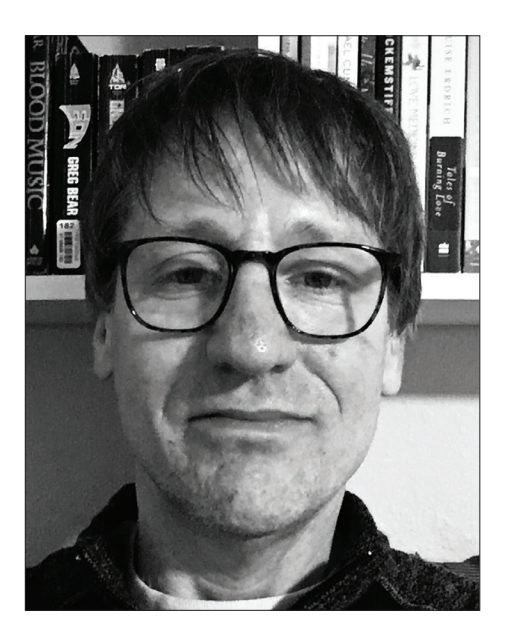
By Chad Erickstad COLUMNIST

Comparing a movie to the book can be a trying experience. The book almost always contains more information—more backstory, more secondary characters, more side plots. I believe it is more challenging, and rare, for a movie to measure up to the book.