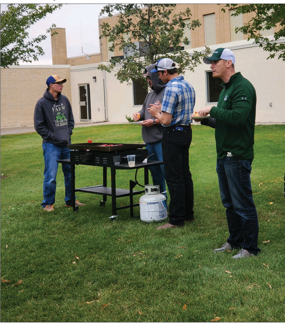
The BSC Agriculture Club treated guests to tailgating events before game time.

Bump, Pet, Spike night at the BSC Armory. Monetary donations and items were collected to benefit local rescue Furry Friends Rockin' Rescue.