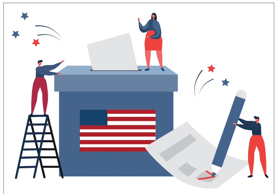
Graphic Credit: The Poynter Institute