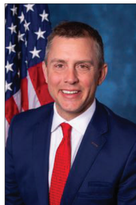
Kelly Armstrong (R)

Representative Kelly Armstrong (R) , has the following to say on policy as North Dakota House Representative: