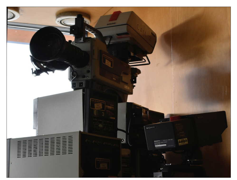
Cameras and monitors decorate Dakota Media Access's front windows. DMA offers classes on how to use cameras and other equipment.